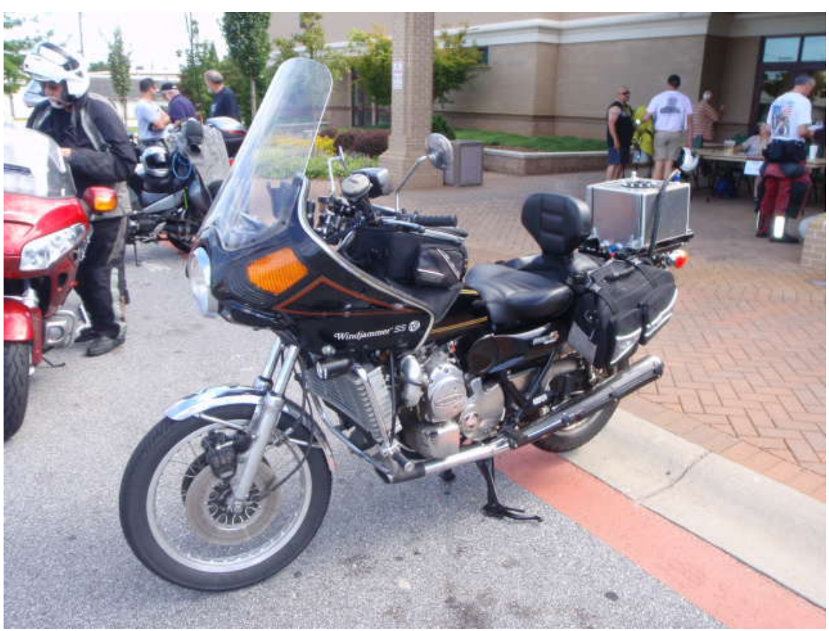
1976 Suzuki RE-5 Rotary Engine-Powered Motorcycle

There are just a few bikes that don't fall into the touring, sport-touring, dual-sport mold. There are two sport bikes, a Honda CBR1100XX and a Kawasaki ZX12R. There are two 1970's vintage Suzuki RE5 rotary engine models that are probably best classified as "standard" models, but now fit solidly in the "Hopeless" class.